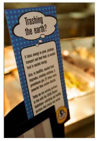
Some campus cafes have developed signage comparing the overall climate impact of various menu choices.

WWC's sustainable food task force has been tracking local foods served and the emissions from food waste, and plans are in the works to begin to track the climate benefits of foods lower on the food chain in the 2009/10 year. "Sodexo has been tremendously supportive of our sustainable food initiatives," says Flood. "They have incentivized our shift to green even though there have been some challenges to sourcing better food options."